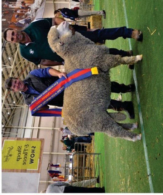
Fine Wool Poll Merino Ram Sashed Champion Sydney Show