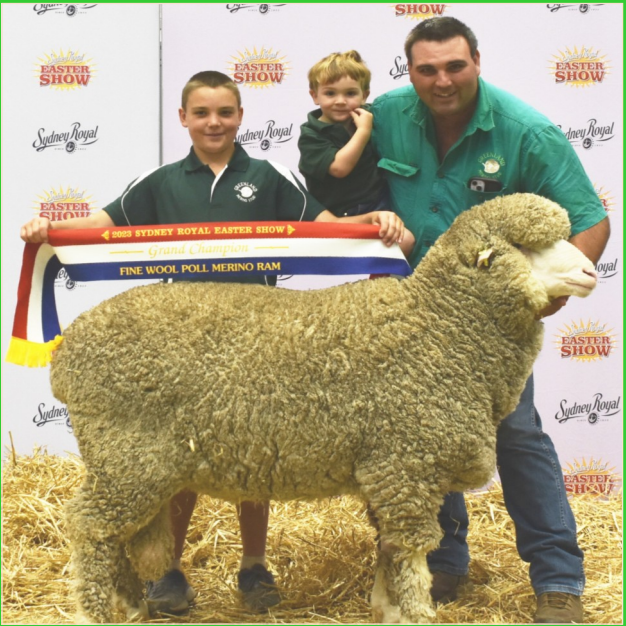
Grand Champion Fine Wool Poll Merino Ram Sydney Show 2023